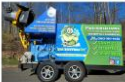
TRASH BIN CLEANING